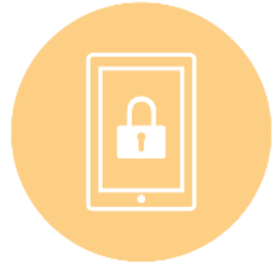
Locking Down Service